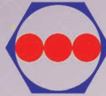
Department of Industrial Engineering and Management