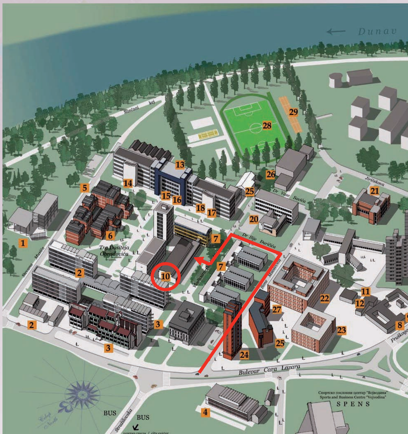
Building No. 10 – Faculty of Technical Sciences – Trg Dositeja Obradovića 6