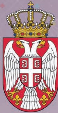
Republic of Serbia Ministry of Education, Science and Technological Development